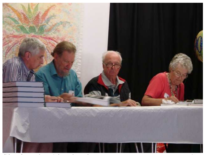
Signing the Aloe books