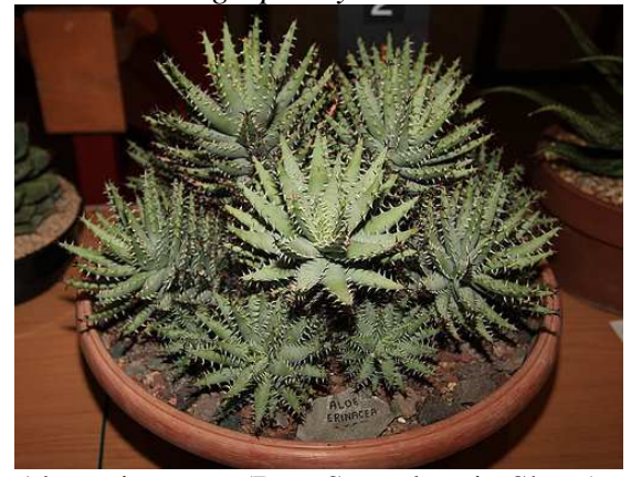
Aloe erinacea (Best Succulent in Show)