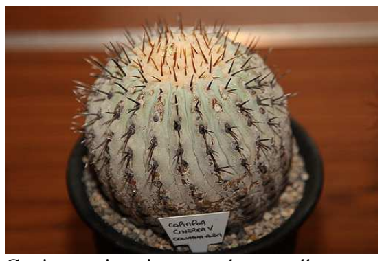
Copiapoa cinerria ssp. columna-alba